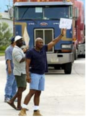
Striking truckers stand in front of a truck leaving the Port of New Orleans Monday. The

Truckers!! We need your submissions. Send us news, updates, letters, pictures or drawings of the struggles in your ports and areas to print in our coming. Contact us at: intexile@iww.org or IWW, PO Box 11412, Berkeley, CA 94712.